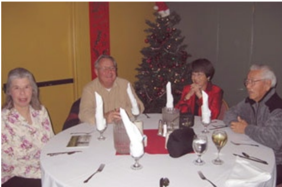
Fun and conversation at the Christmas Party