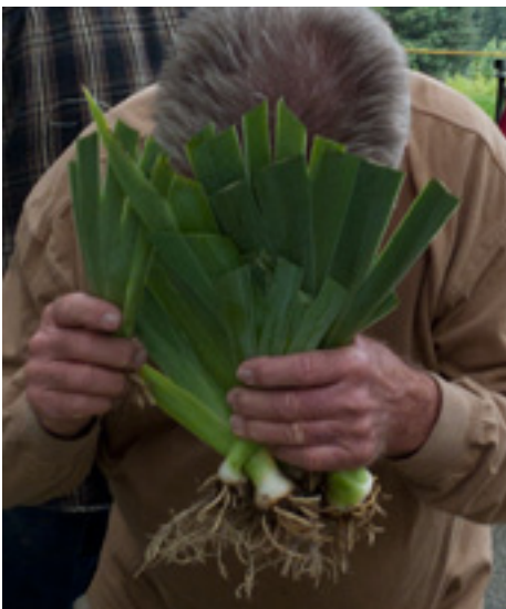
Hidding in so many iris