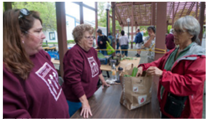
Deer Park Aptos Iris sale