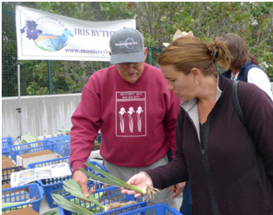
Iris sale at the Cabrillo Farmers Market