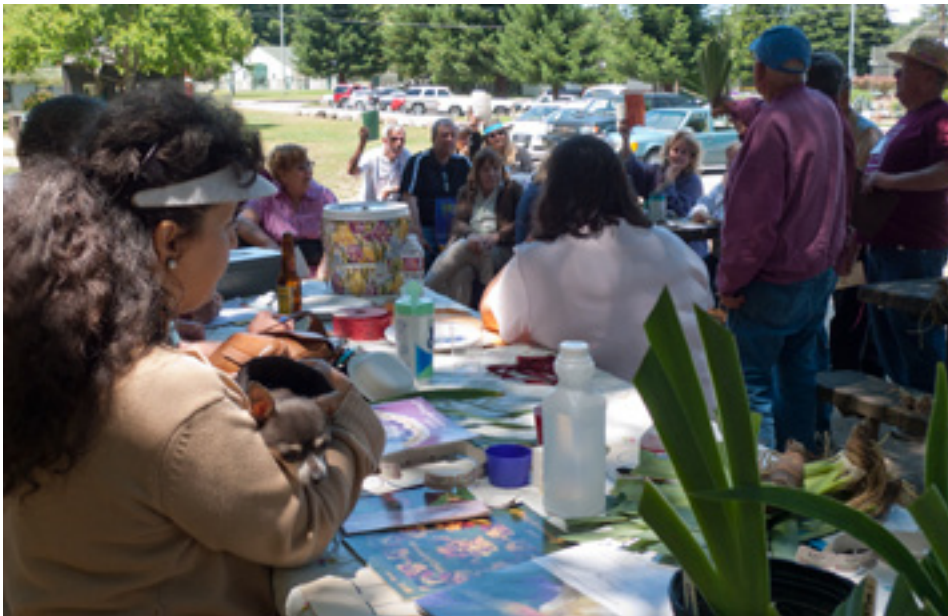
Bidding for iris at the picnic..

Next meeting Friday, 19, 2011 Doors open 7:00 P.M. Meeting 7:30 P.M. Place Native Sons Hall 239 High Street, Santa Cruz