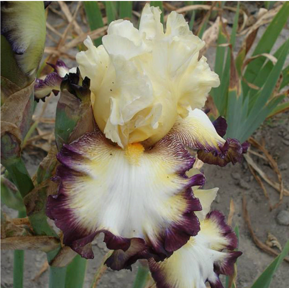
Hat in the Ring Ghio, 2019 TB introduction